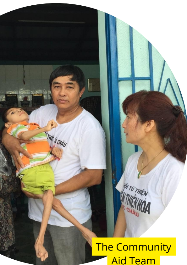
The Community Aid Team